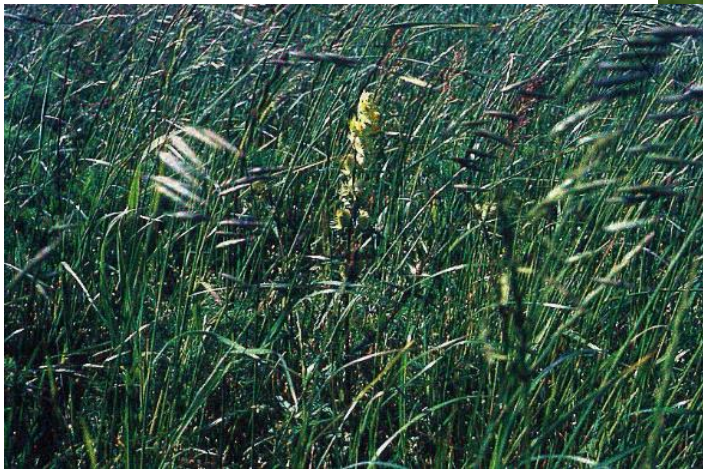
Somerford Mead in June 1987. Yellow-rattle has germinated, but the sward is grass dominated and species poor.

In 1986, seed from nearby Oxey Mead was harvested by Emorsgate Seeds and spread on Somerford Mead, which was then managed as a hay meadow with a late June/early July hay cut, and aftermath grazing with 12 heifers and 50 sheep. Similar management was undertaken in 1987 and 1988.