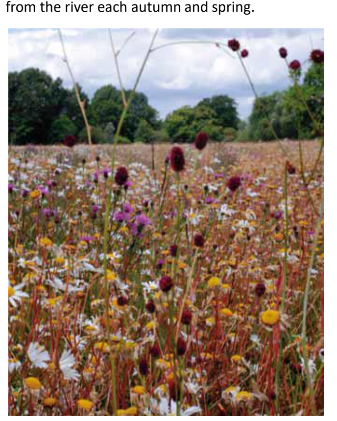
Broad Meadow in 2012.

Broad Meadow was species-rich floodplain meadow until the 1970s, when the farmer gave up dairying and converted to arable. The fields were used for arable production until 2007 when the last crop of oilseed rape was harvested. During this time artificial fertiliser was used as required. The field floods