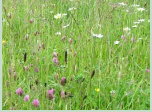
The restored meadow after 3 years

In the future, we hope to continue with our monitoring, as well as looking at the invertebrate data, sward structure, nutrient and grazing data in a multivariate analysis to evaluate the community structure in response to