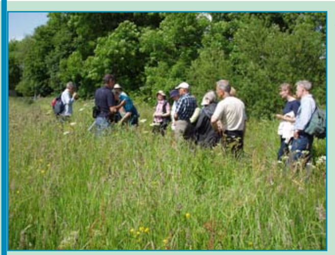
Members of the public enjoy the meadows

My Flood Risk Management colleagues outlined the use of York's floodplain meadows for flood storage – the area is technically a reservoir - and the steps the Environment Agency is taking to tackle flood storage on a river catchment scale.