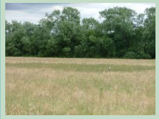
The control plot within an area where hay was spread

To test for the effects of this technique, green hay spread plots were paired with control plots (30 x 30 m) where no seeds were added.