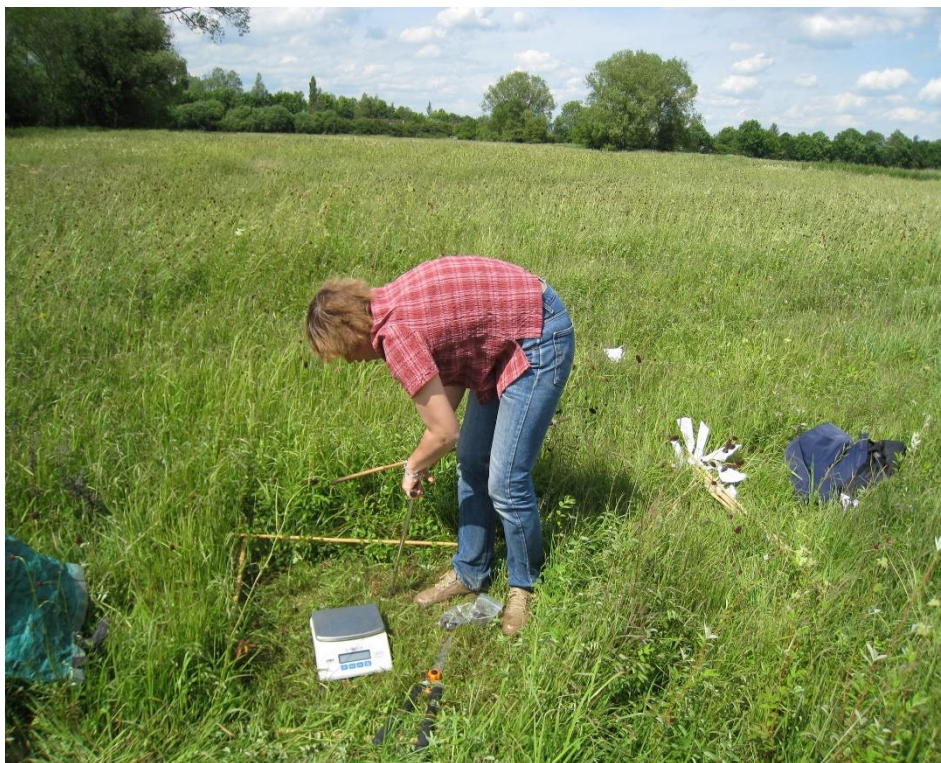
Soil samples were taken from within a 1 x 1 m area.

Three soil samples were taken from each of the six botanical monitoring blocks across the Meads. An additional 24 samples were taken from areas not well-represented by the monitoring blocks, and four additional samples were taken from New Marston Meadows SSSI. Sample sites were located within a range of plant communities. Soil samples were taken from the top 100 mm of the profile and each sample was composed of 12 separate 10 mm diameter cores, combined into a single pooled sample to smooth out fine spatial heterogeneity in soil properties. The soil was oven dried in Open University soil laboratories at 40°C, ground to pass through a 2 mm sieve and analysed for pH, total phosphorus, extractable phosphorus using the Olsen method and major cations ( \text{Ca}^{2+} , \text{K}^+ , \text{Mg}^{2+} , \text{Na}^+ ).